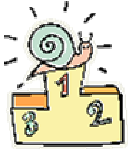
Snails on the Podium