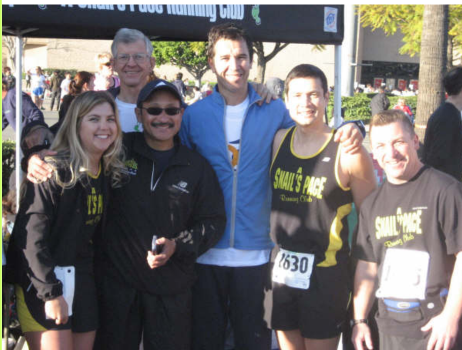
Happy Snails to You!